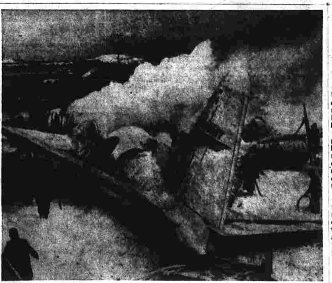
Explosion work amid foam-covered wreckage on Trans-Canada Viscount which was struck by a Sea-View passenger airliner at Idlewild. Smoke pours from the Constellation in the background.